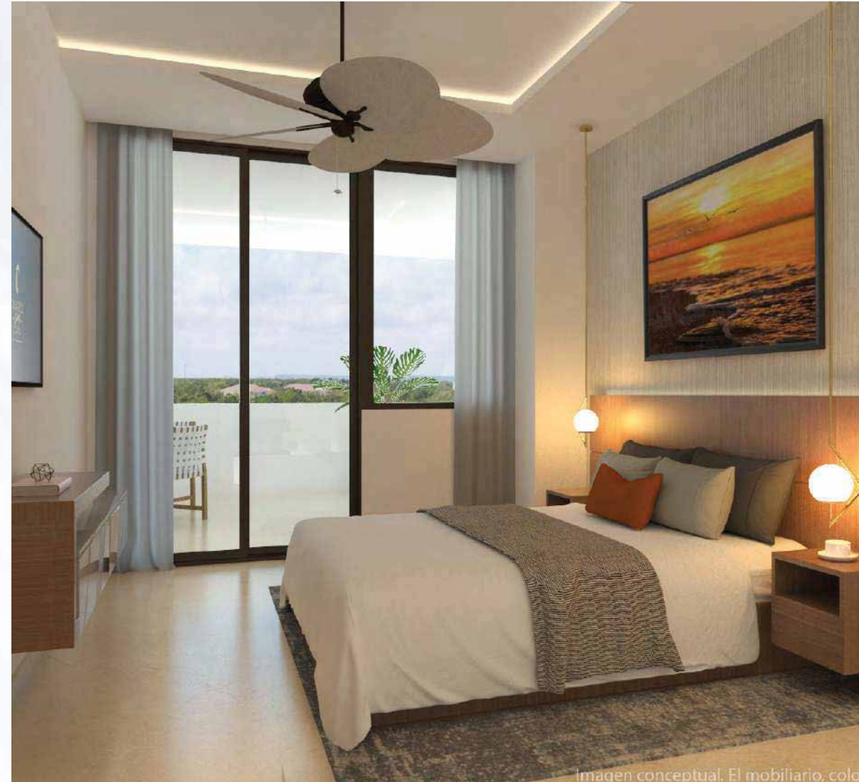
Imagen conceptual. El mobiliario, color