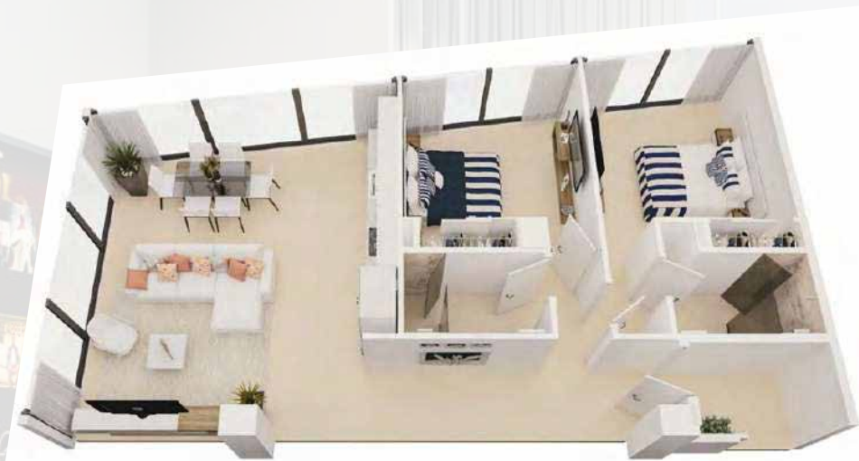
3D Floor plan - 2 bedroom corner units