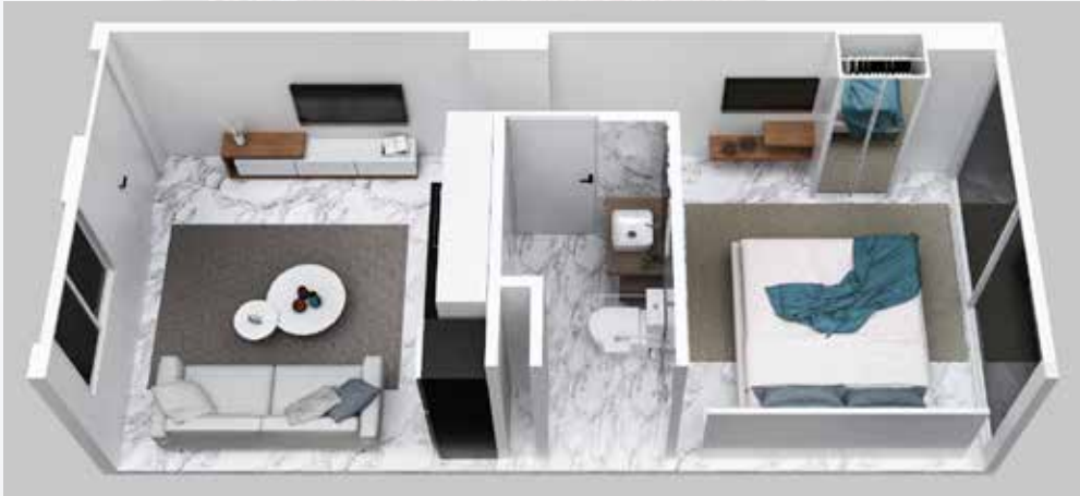
3D Floor plan - 1 bedroom unit